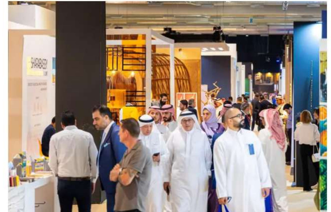
The trio of inaugural shows will empower future of play, stationery, and gift-giving from 16-18 September in Saudi capital.

dmg events will organise the Inaugural Kids & Toys Expo Saudi Arabia, Stationery & Paper Expo Saudi Arabia, and Gifts & Homeware Expo Saudi Arabia. All three shows will be co-located under one roof at the Riyadh Front Exhibition & Conference Centre from September 16 to 18, providing attendees with a comprehensive platform for all their sourcing needs.