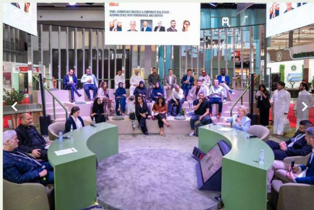
A session in progress at Orgateco Workspace Saudi Arabia and Stationery, Paper, Gifts, Homeware, Kids and Toys – at the Riyadh Front Exhibition and Conference Centre.