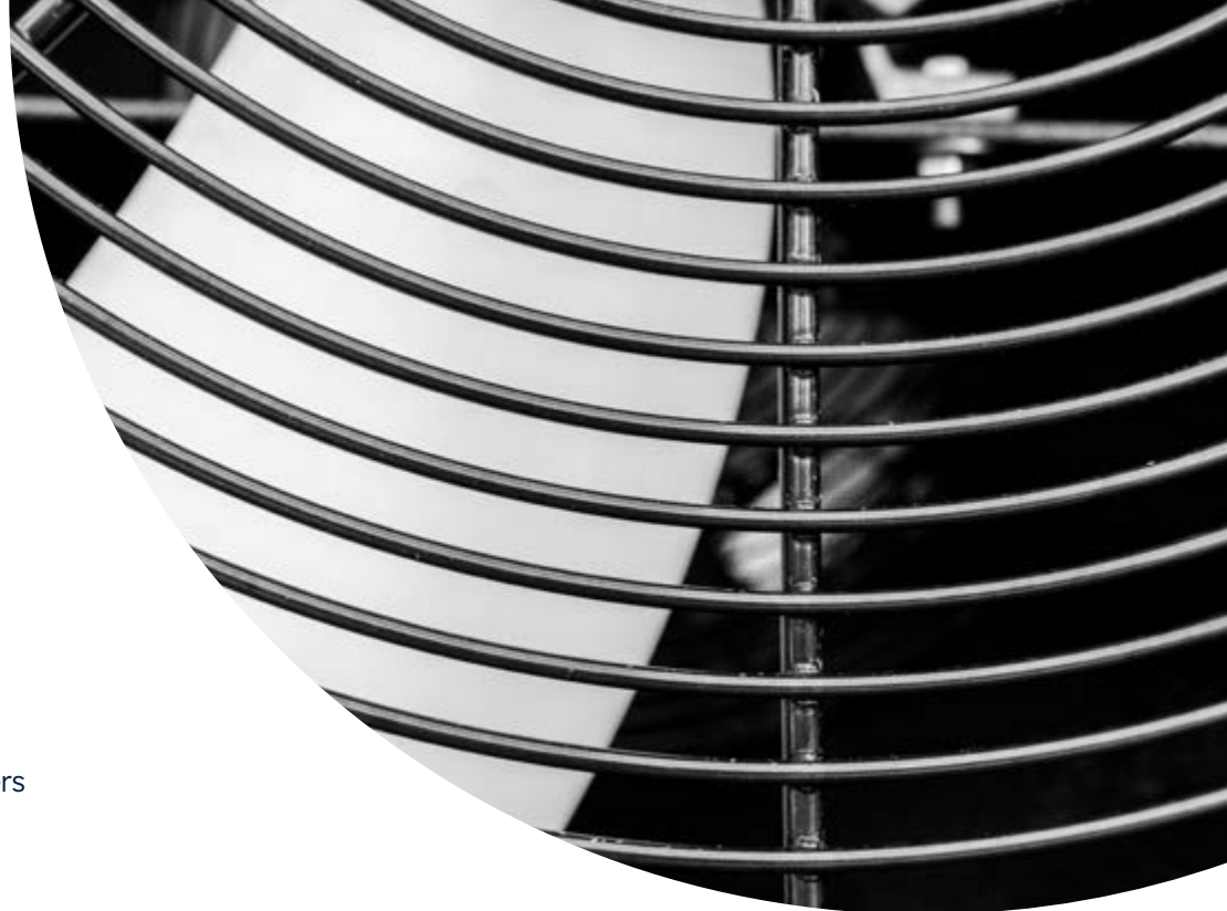
EXHIBIT AT THE PREMIER EVENT FOR THE HVACR INDUSTRY

With support from government bodies and leading associations, HVACR World serves as the annual meeting hub for those committed to advancing sustainable, energy-efficient technologies.