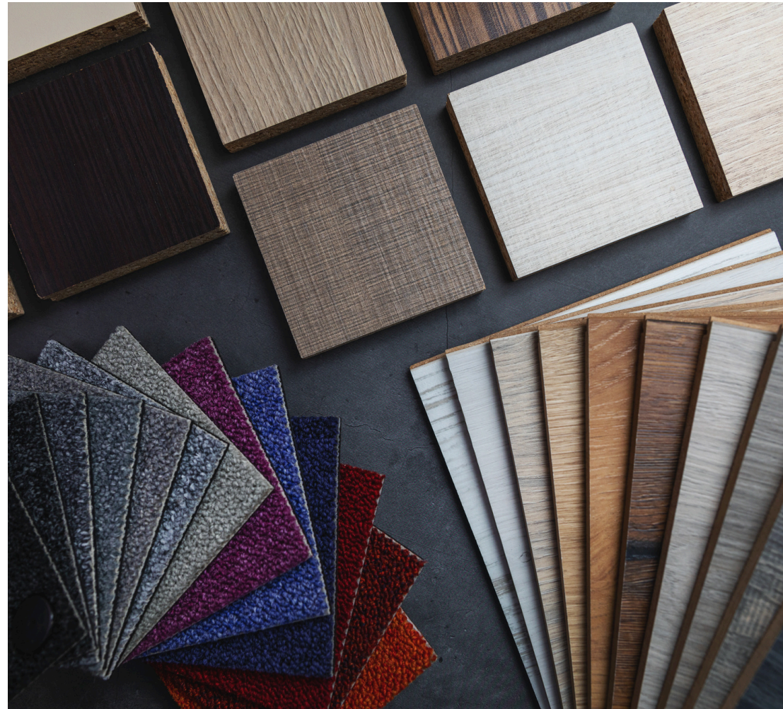
Building Interiors & Finishes

Dedicated sectors enabling visitors to easily find and source the right solutions for their projects.