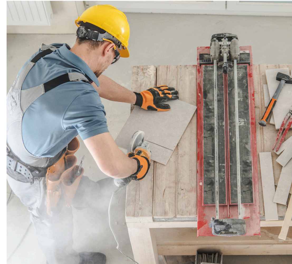
Construction Tools & Personal Protection Equipment (PPE)