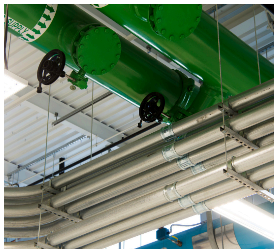
Mechanical, Electrical & Plumbing Services (MEP)