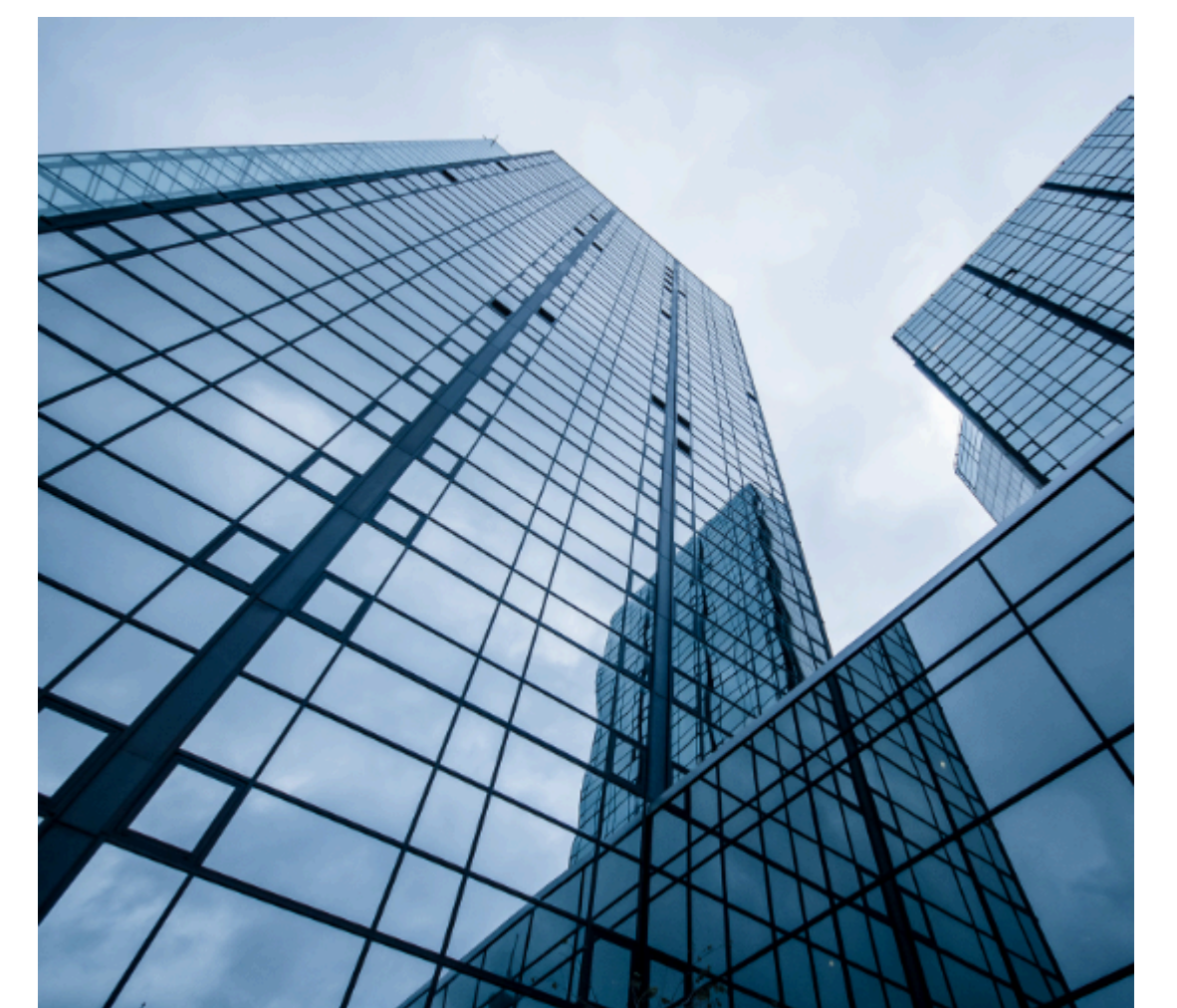
Windows, Doors & Façades / Special Construction