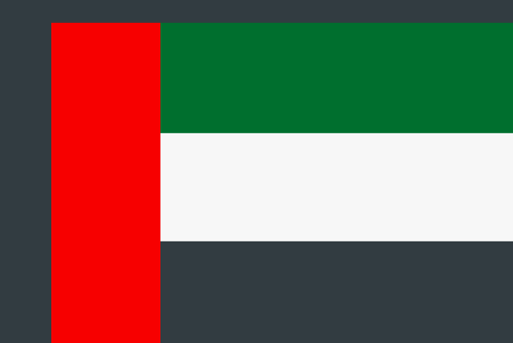
United Arab Emirates