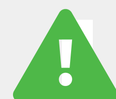
Exhibit now and connect with leading decision-makers from contractors, consultants, developers, architects and engineering firms at Big 5 Construct Nigeria.