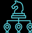
Smart City Strategists