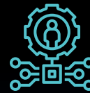
Digital Infrastructure Engineers