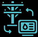
Public Utilities Professionals